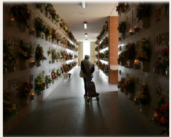
An interior mausoleum