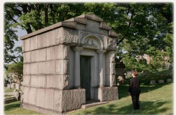
A private family mausoleum