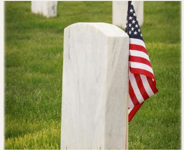
A single grave in a veterans cemetery